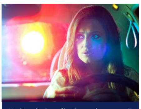
Police lights flash and you pull your vehicle over.