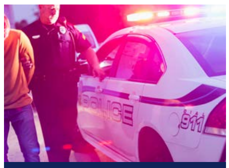
For whatever reason, the officer decides to arrest you.